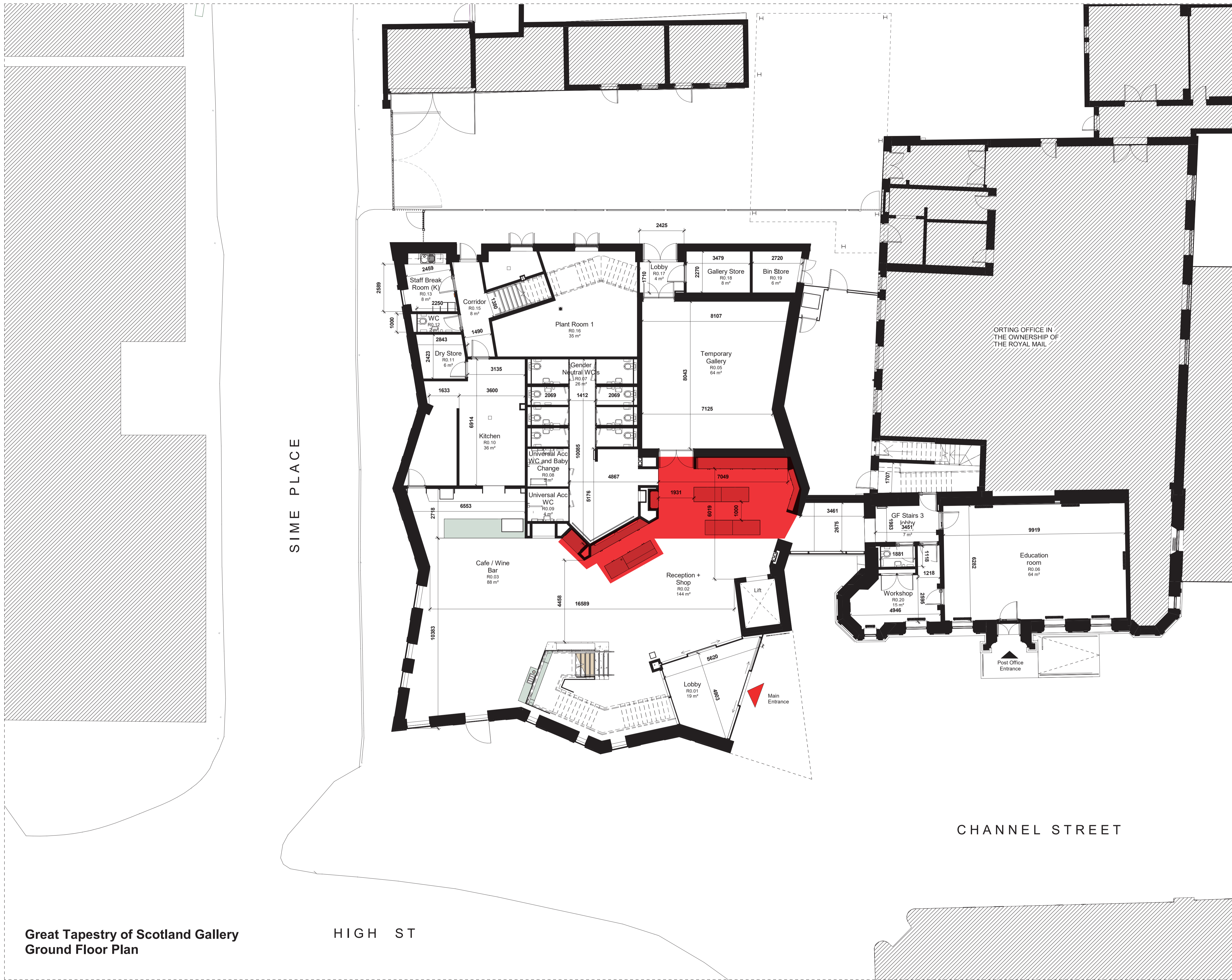
Great Tapestry of Scotland Gallery Ground Floor Plan